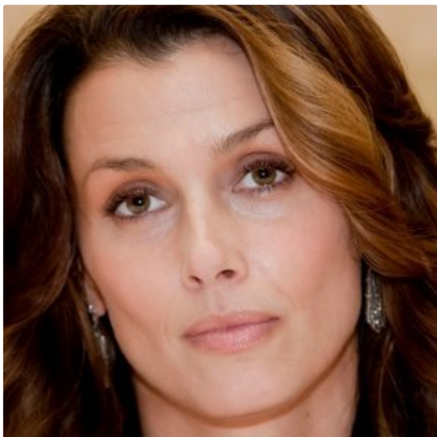
What You Don't Know About the Mother of Tom Brady's First Son