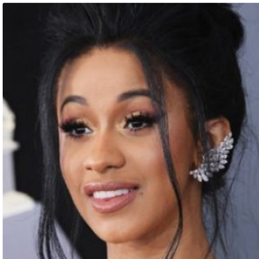
Celebs Who Used to Be Strippers