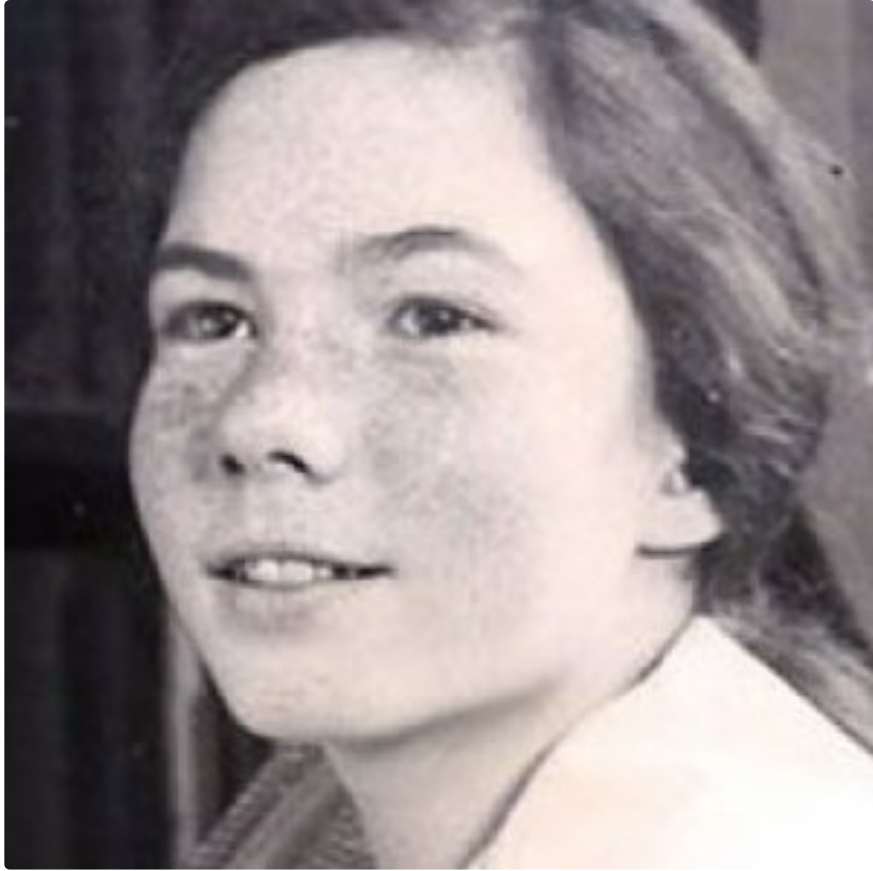
Celebrities Who Went Missing and Were Never Found