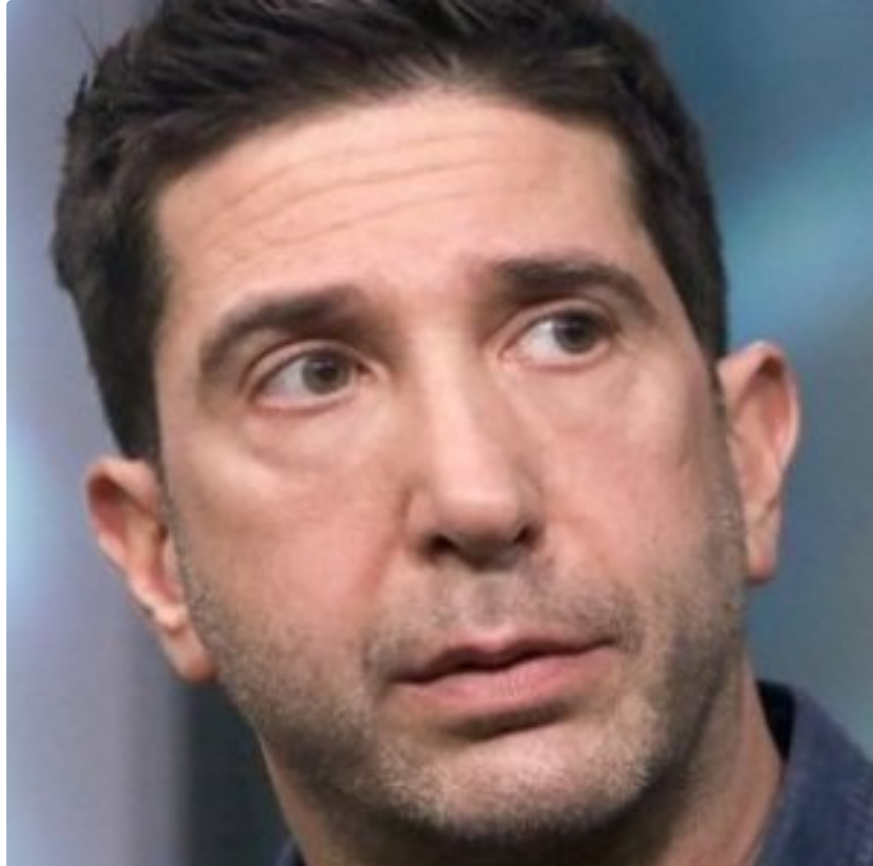
Why Hollywood Won't Cast David Schwimmer Anymore