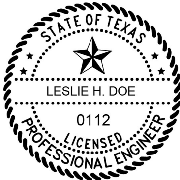
Figure: 22 TAC §137.31(c)