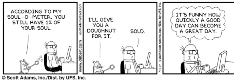
Figure 2: Wally sells his soul for a donut; corruption costs a lot more than donuts, but is essentially the same transaction.

Figure 2 is a humorous view of the moral transaction of corruption and bribery. Wally being of little character sells his soul for a donut!