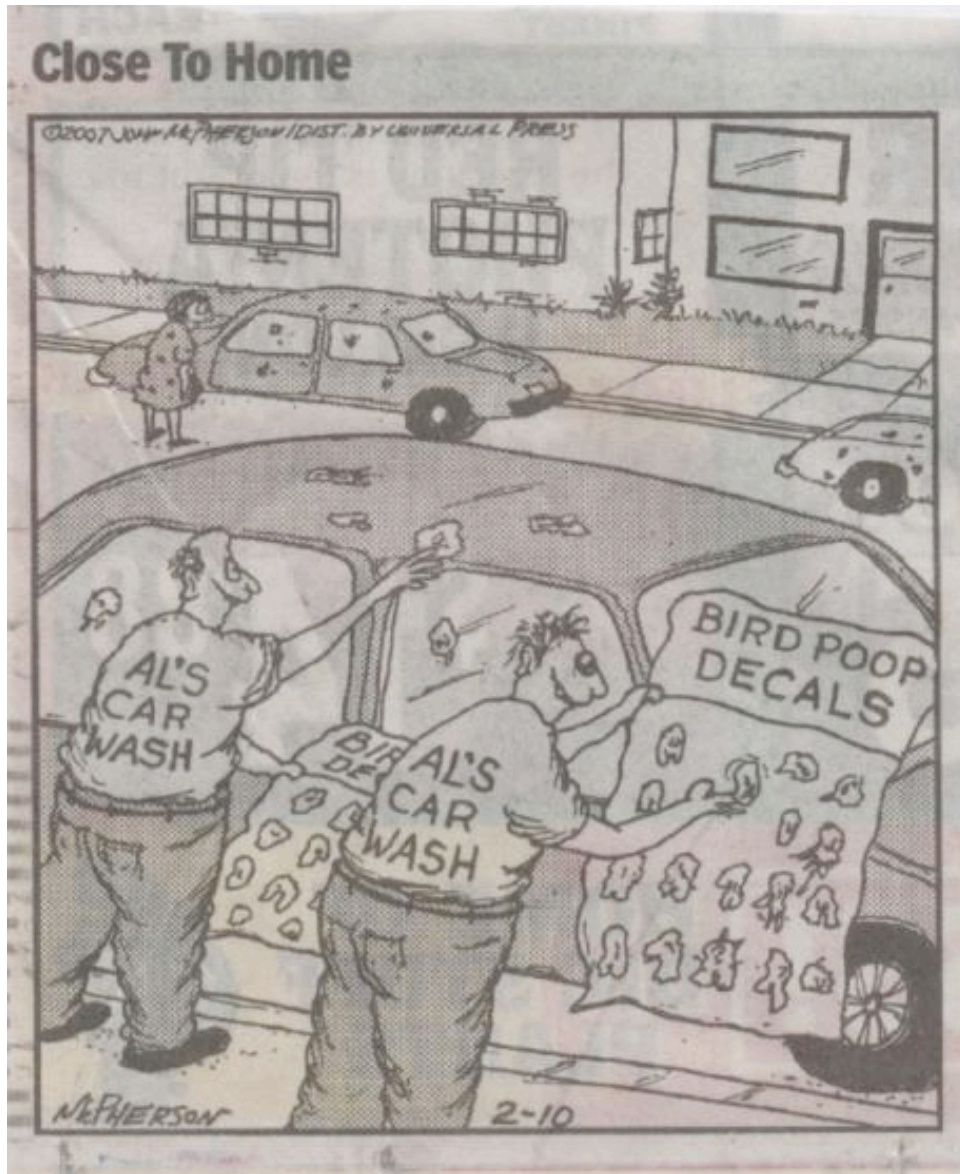
Figure 6: Guerilla advertising; engineering equivalent is planned obsolescence in order to obtain future work.