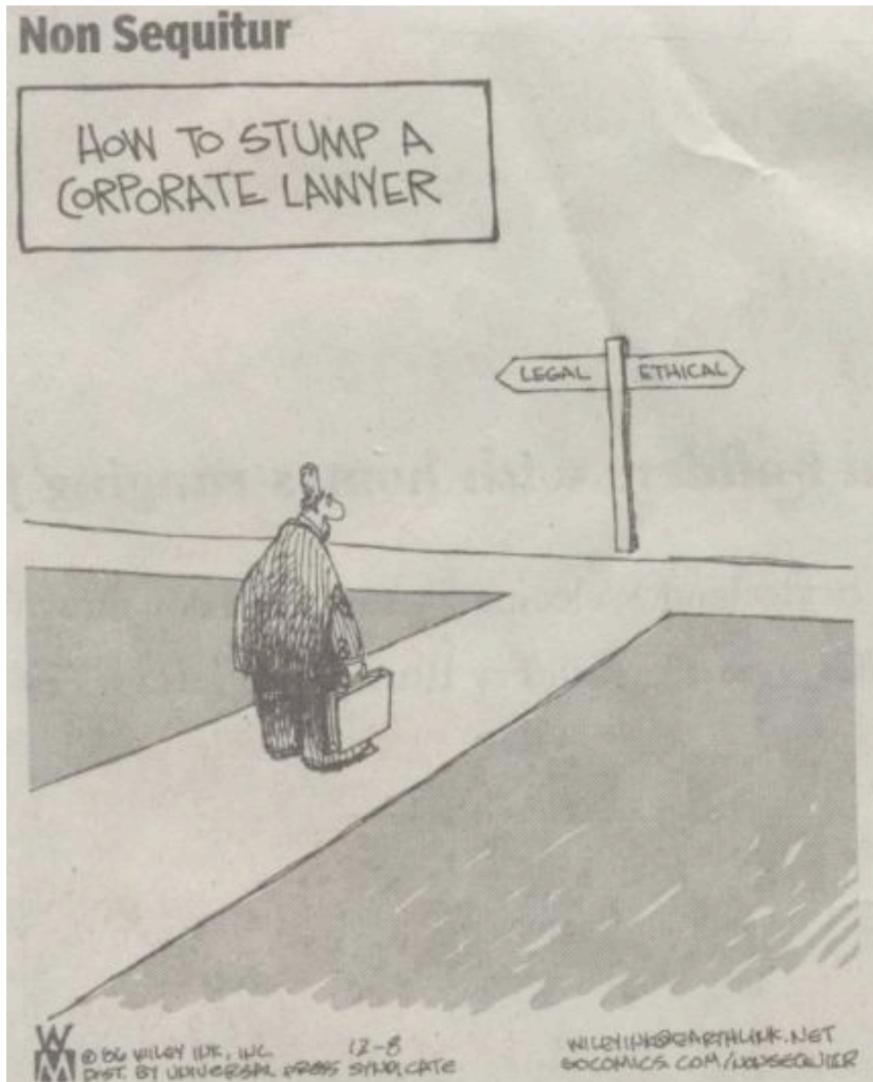
Figure 3: A popular view of ethics and law as it pertains to business; that is they are diametrically opposed.