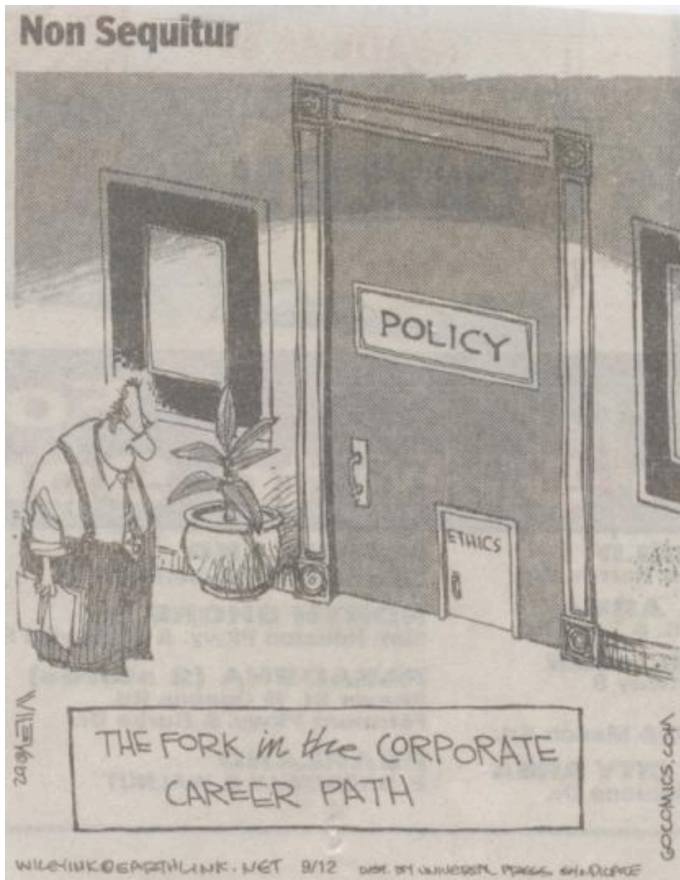
Figure 4: Another view of business principles (policy) and ethics; notice both doors go to the same place.