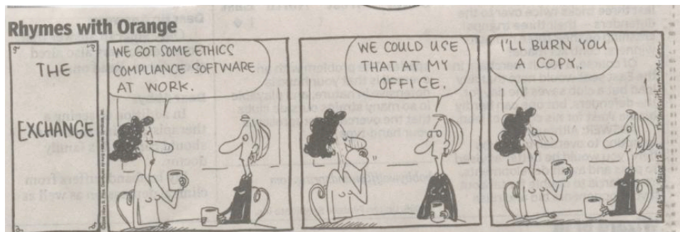
Figure 7: Intellectual property ethics – the situation depicted may be illegal if the software is not governed by GPL type license.

Figure 7 is a humorous look at balancing the public good with the need to document ethical preparation. In the comic, the ethical compliance software (a copyrighted piece of intellectual property) is shared without thought among colleagues at different firms. The act of copying benefits the public (presumably by increasing collective ethical behavior) but it is unethical in that the original developer of the software is economically damaged. While intended as humor, the same situations arise frequently in engineering – fortunately our codes-of-ethics are free (for the price of a download).