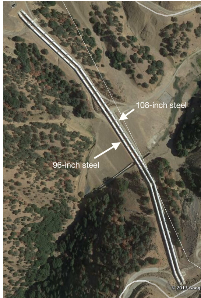
Figure 3: Parallel Pipeline System

5. Figure 3 is an aerial image of a parallel pipeline system in California.