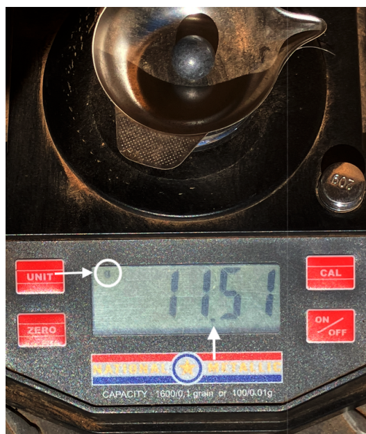
Figure 2: Sphere on scale reading mass in grams