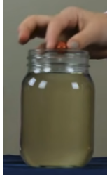
(a) Dropping sphere

The sphere (color coated for visibility) is used to estimate viscosity for an unknown liquid as depicted in the photographs below. A 50 ml sample of the light amber liquid has a mass of 71.5 grams at 20°C. The time required for the sphere to traverse 127 mm was observed to be 3.9 seconds. Determine: