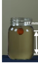
(b) Time = 0 sec.